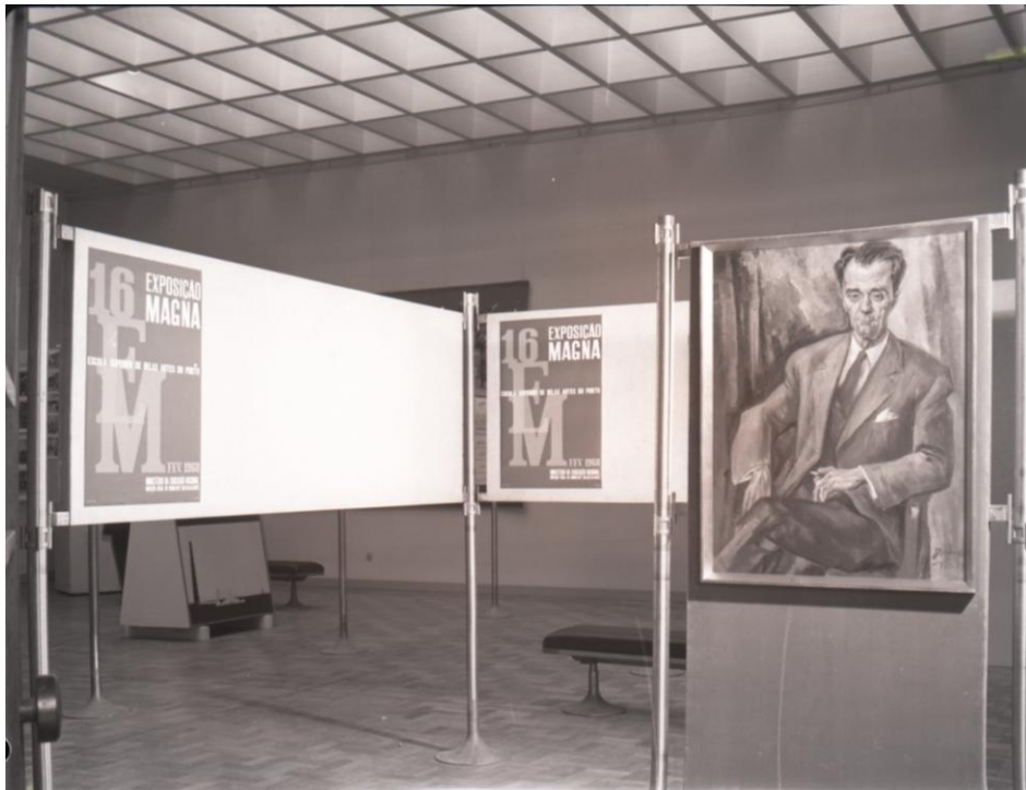
Figure 2. Photograph from the box of the Oporto School of Fine Arts. Magna Exhibition, 1968.

From the beginning of the construction of our project, we have known that the diversity of architects who were Teófilo Rego's clients would permit a rereading of the history of modern architecture produced in Porto and Northern Portugal. This certainty resulted from the fact that Rego's commercial archive is in possession of photographs by architects consecrated by the history of Portuguese modern architecture, but also of photographs by other less known professionals. The photographic register of the latter's works allows us to establish a wider panorama of architectural production at a time when the action and the pedagogical project carried out by Architect Carlos Ramos at the Escola de Belas Artes do Porto [Oporto School of Fine Arts] (ESBAP) was of paramount importance.