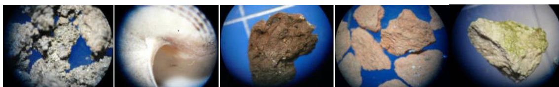
Figure 1 – Material observations under stereoscopic microscopy, after 11 months of use in CWs, with 20x magnification (left to right): coal slag; snail shells; cork granulates; brick fragments; limestone fragments.

Microscopic observations did not show significant changes after four and eleven months of use for most materials (Figure 1), except limestone, which exhibits an evident formation of biofilms, which were not observed after four months of use.