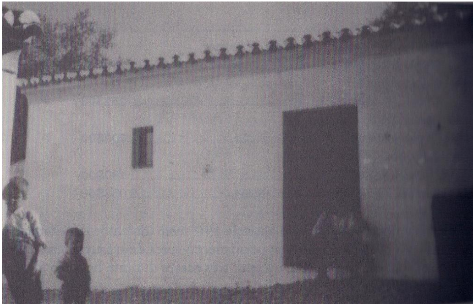
Figure 3. Photograph of vernacular house in Monte da Casada (S. João, Castelo de Vide) published in Inquérito à Habitação Rural

In some photographs, the closeness of the house, whose façade occupies almost the whole available space, permits neither field depth effects, nor reveals concerns with the object's global framework that appears thus exclusively focused on a bi-dimensional plan. In other photographs, when the building is photographed in its tri-dimensional component, either its relationship with its environment is registered based on the reference indicators of the Questionnaire – Guide's , or it appears lost in its landscape, demonstrating its isolation 10 .