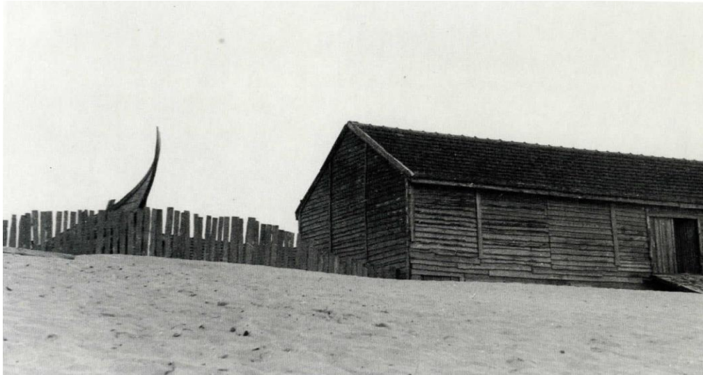
Figure 2. Beira Litoral coastal barn photographed by Orlando Ribeiro, published in Orlando Ribeiro. A Casa e o Mundo (s.d.)

The gaze of Orlando Ribeiro on these wood architectures is accurate: "One storied houses, salient chimneys, balconies, everything was built with great mastery and elegance, in this material, rare in our popular architecture" (Ribeiro apud Belo 2012).