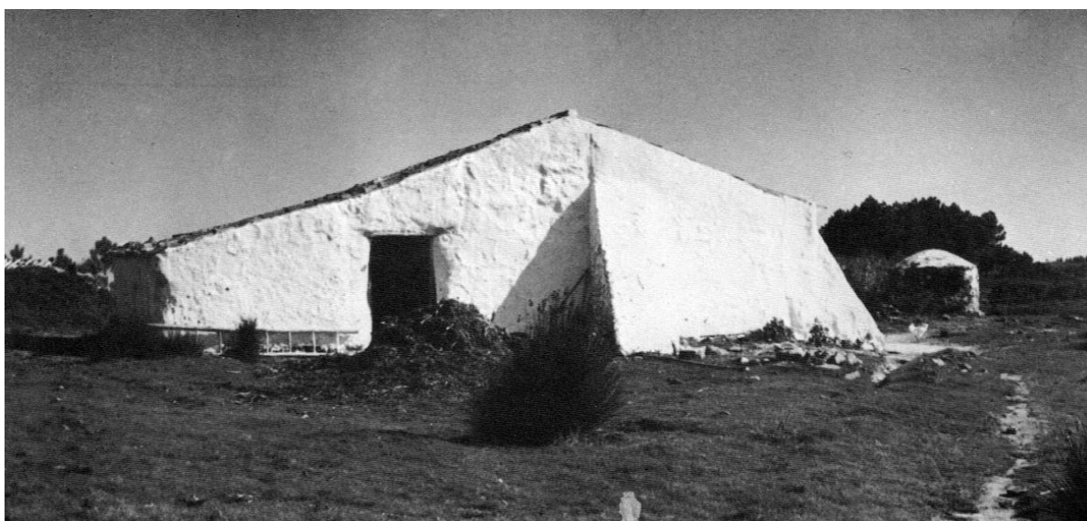
Figure 6. Mudbrick house in Maria Vinagre (Aljezur) photographed by the zone 6 / Algarve team and published in Arquitectura Popular em Portugal (1961)

Indeed, as they have recognized right in the introduction to Arquitectura Popular em Portugal (1961 [2004]: XXV), the images selected for the publication and focusing essentially on the formal component of vernacular architecture may have contributed to 'a distortion of the real aspect of life conditions of the villages', and thus for the construction of an idealized image of a rural world. The life conditions of the inhabitants of those architectures were, however, quite hard, as already demonstrated by the agronomists Survey .