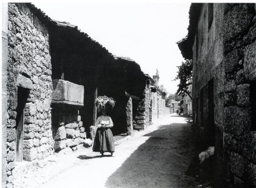
Figure 1. Photograph of Carlos Relvas. Silver-gelatine negative; impression contemporaine. Published in Carlos Relvas and House of Photography (2003)

Photographs and engravings produced with photographs became a constant in the journals of the time, 2 thereby, contributing to the diffusion of until then unknown monuments, landscapes and architectures.