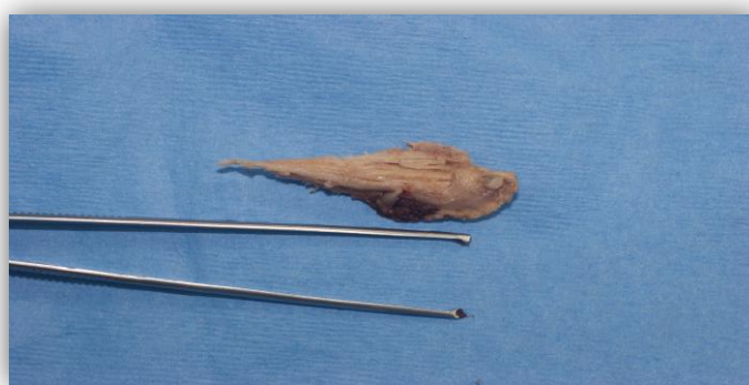
Figure 1. Representative example of the size of a keratoma.

Surgery under general anaesthesia was performed in 4 horses using essentially the same procedures, except that the horse was positioned in lateral recumbency with the appropriate aspect of the affected digit facing up. After surgery, broad-spectrum antibiotic therapy was initiated and anti-inflammatory treatment was instituted.