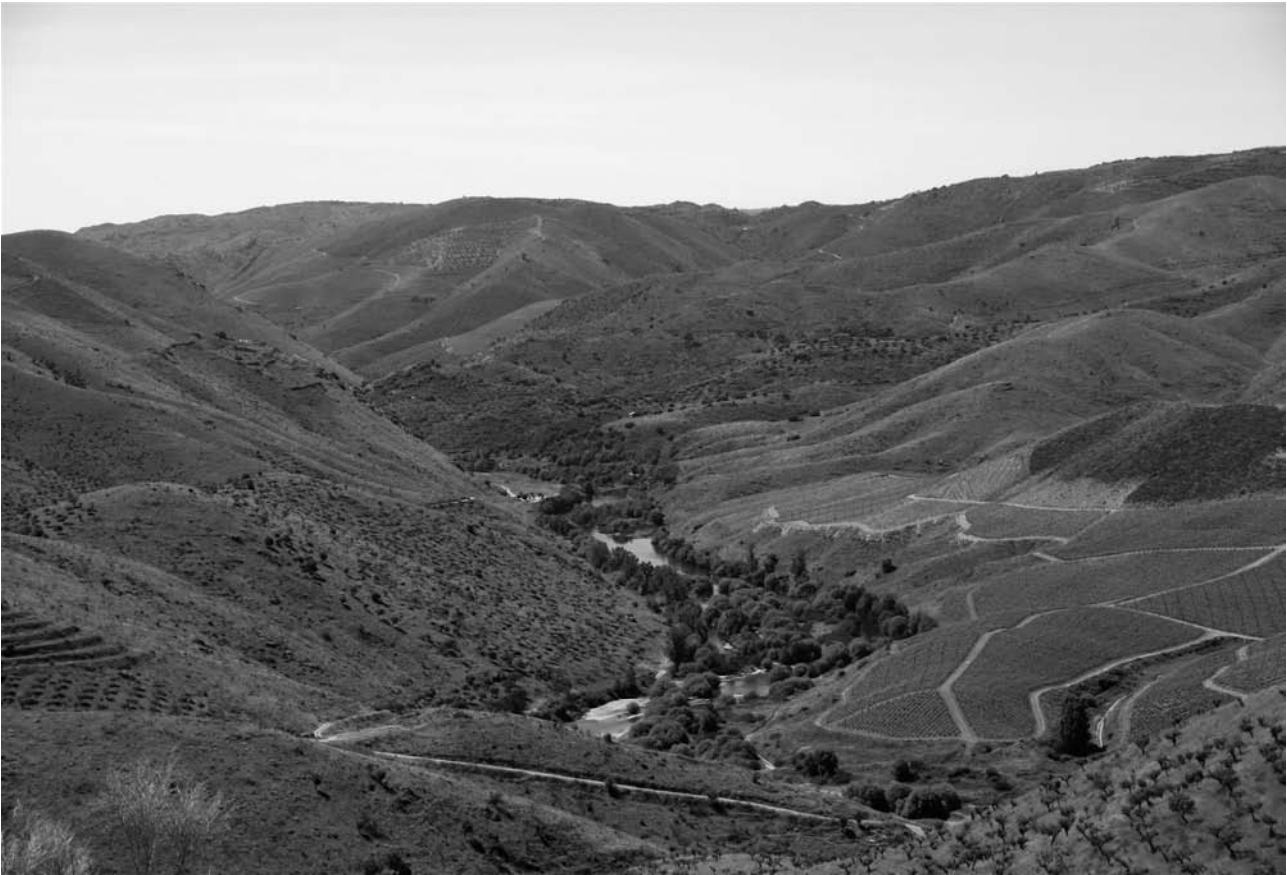
Fig. 6.2. Penascosa and Quinta da Barca seen from downstream. The red B marks the beach; on its left side, the rocky and strongly inclined slope of Penascosa; on the its right side, the more gentle, but also less isomorphic, geomorphology of Quinta da Barca. For details, see next figure

et. al. , 2002, 64-65, fig. 4); the west sector of the site corresponds to another strong pending slope (along 220 m the differences in high vary between 258m on the top, and the 170 m of the terrace mentioned above). Another important difference in respect to Penascosa is the proliferation of waterlines running perpendicular to the Côa and crossing the site. On the other hand, the Quinta da Barca stream shows a quite irregular course, running downstream trough a straight valley and widening upstream in a point where it receives the waterline that nourishes it by North. Small streams of lesser importance connect the Quinta da Barca stream with the terrace described above.