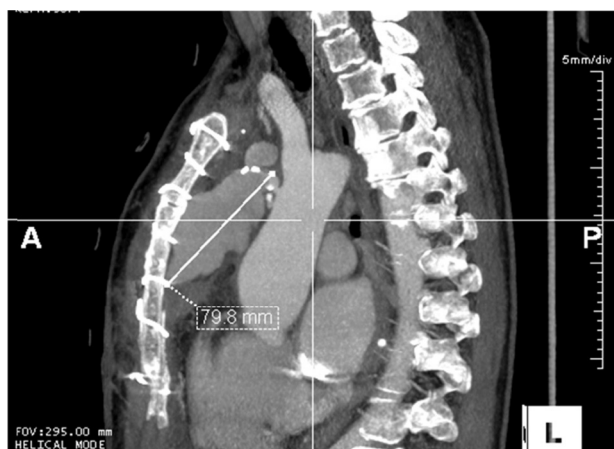
Figure 2 Thoracic computed tomography of the ascending aorta (sagittal plane), showing an image compatible with a pseudoaneurysm, maximum diameter 79.8 mm, in the anterior wall of the ascending aorta.