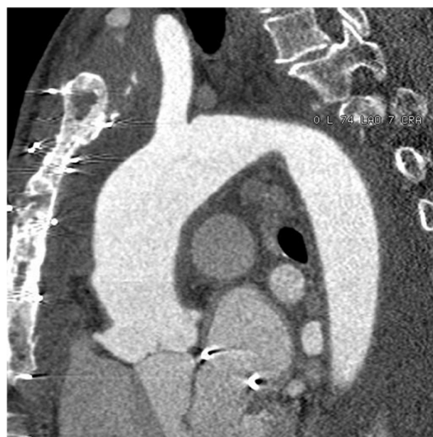
Figure 4 Thoracic computed tomography of the ascending aorta (sagittal plane) six weeks after surgery, showing dilatation of the ascending aorta, with no evidence of recurrence.

The patient remains under medical follow-up, with aortic re-evaluation scheduled in six months, followed by annual imaging assessment.