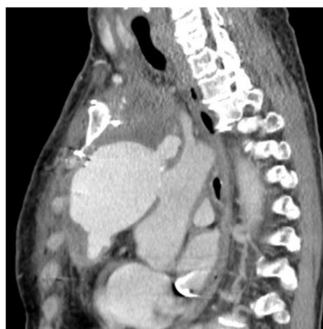
Figure 3 Thoracic computed tomography of the ascending aorta (sagittal plane), showing an image compatible with a large pseudoaneurysm.

antibiotic therapy was initiated and continued for six weeks, after which the patient was discharged clinically well, with no radiological or echocardiographic abnormalities.