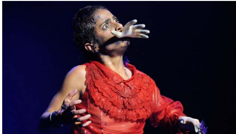
Figure 1. Guintche .

heritage as a former Portuguese colony, but probably, or from the eye of the beholder, as a symbol of strength and struggle. A boxing bag and a figure of permanent incoherence which, haunting the Western theatrical apparatus, return the gaze to the (European) spectator.