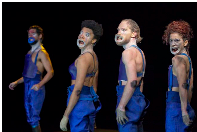
Figure 3. de marfim e carne – as estátuas também sofrem. © Hervé Véronèse. (cortesia da artista)