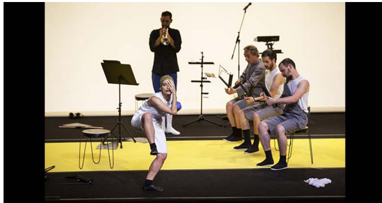
Figure 5. Bacantes – Prelúdio para uma purga. © Filipe Ferreira. (cortesia da artista)