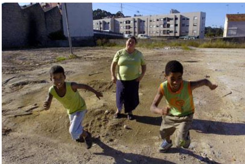
Figure 2. This picture was taken by Paulo Pimenta under an effort by the company itself to document the areas visited during the performance. This picture shows quite well the living conditions and type of landscape that would be seen by the performance's audience. The company put in a lot of effort documenting the process and interacting with the communities involved, even producing a short documentary portraying the performance, A Caminho do Resto do Mundo , by Pedro Maia (2007), which included amateur shots taken by some of the inhabitants of these areas.

Through this performance it is possible to recognize some of the different types of spaces described by Judith Rugg (2010: 33) that are used by site-specific theatre, the most meaningful for this work was the contingent spaces, that is, the spaces that are contiguous to the hierarchical spaces of the organized city. These contingent spaces, states Rugg, are "transformed into installations for time-based performances of the overlooked, contesting the construction of the city as spectacle primarily determined through the hegemonic ordering and regulation of architecture and planning." (2010: 34), usually to "waste reveals the myth of progress driven by the (supposedly) innovative power of capitalism and must be hidden" (2010:39).