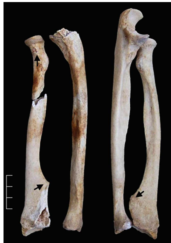
Figure 2. Right and left forearm (anterior view): osteochondromas can be observed on both radii (arrows).