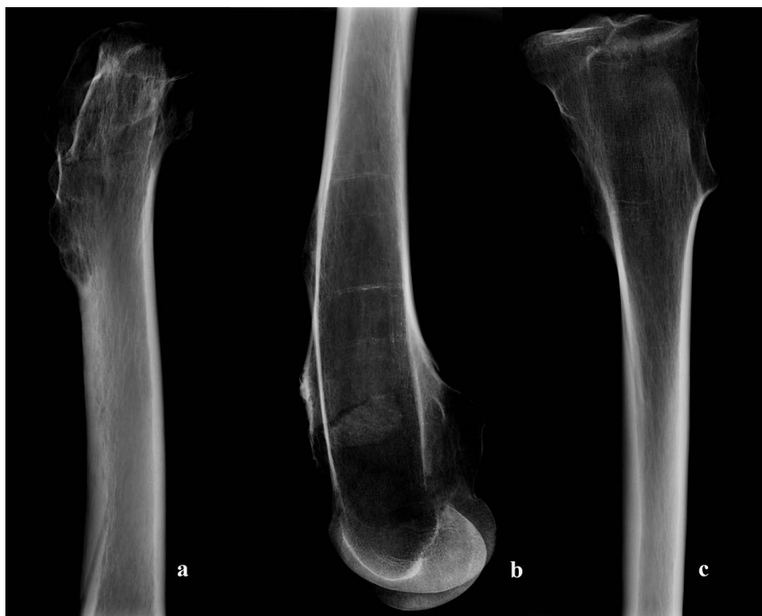
Figure 5. Radiographic images of the proximal (a) and distal (b) right femur and proximal right tibia (c). (Parameters: 62 kV, 8 mA.)

presence of the cartilage cap in vivo , as also noted by Aufderheide and Rodríguez-Martín (1998) in a description of bone OC. There was also an absence of endosteal scalloping (Figure 5).