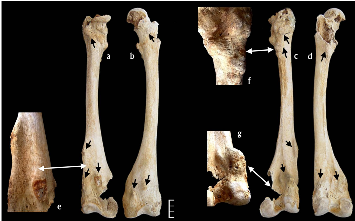
Figure 3. Right ((a) anterior and (c) posterior views) and left ((b) anterior and (d) posterior views) femora, exhibiting osteochondromas on multiple locations (arrows). Close up of the affected areas: (e) distal and anterior osteochondromas; (f) proximal and posterior osteochondromas, and (g) distal and posterior osteochondromas.

noticeable on the distal right femur (Figure 5). The dry bone observation of this femoral area shows an irregular defect with darker coloration (Figure 3), which could indicate the