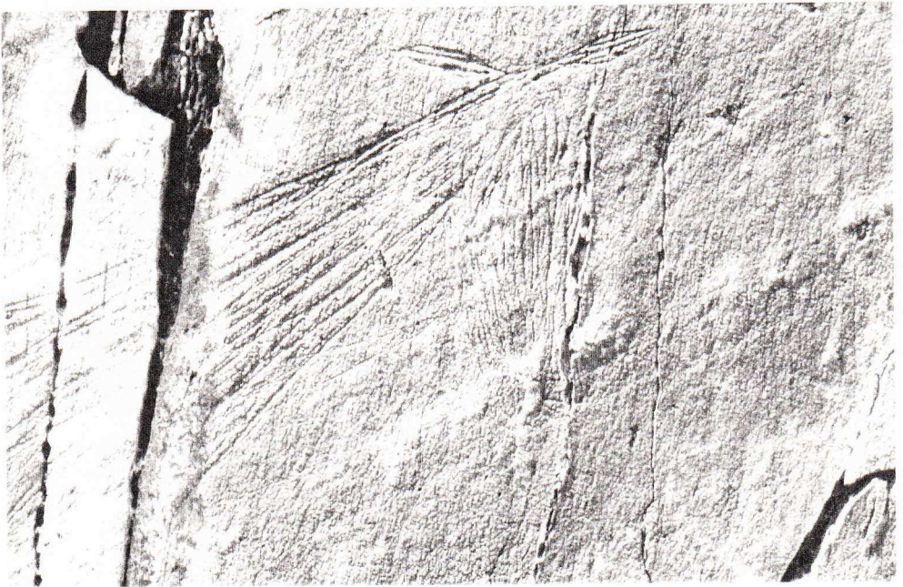
Palaeolithic scratched figure.