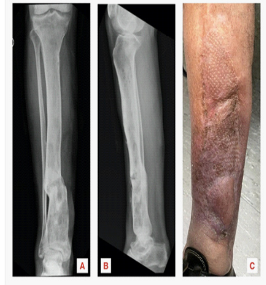
Figure 5: Anteroposterior and lateral plain radiographs one year after the first surgery (A,B); final cosmetic result (C).

Coverage of extensive posttraumatic lower limbs defects can be challenging. The best wound closure must be considered accordingly the patient local conditions, always having as main goal the limb salvage [5]. Cross-leg flap, that has suffered some modification over the past decades, is an alternative option when other coverage techniques are not viable because of the unsuitable vessels [2,3]. A pre-operative CT angiography is important to rule out axial vessel damage and peripheral vessel diseases. After running out two muscular rotated flaps options the authors opted to perform a fasciocutaneous cross-leg flap. A free muscle flap could be considered but the poor local conditions, the patient's comorbidities and old age should prompt other simpler and most successful possibilities. A stable fixation of both legs is mandatory to avoid flap failure. Cross-leg flap does not require microsurgical skills and has the advantage of taking blood supply from the contralateral non-traumatized arterial system. The discomfort inherent to a three weeks period of both legs stabilized together was well tolerated by our patient, without any thromboembolic complication of the long immobilization period. Therefore, the authors recommend the cross-leg flap as good option when other coverage procedures cannot be considered.