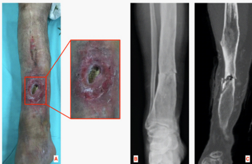
Figure 1: Anteromedial cutaneous ulcer with bone exposure of the right leg (A); pre-operative anteroposterior plain radiographs (B) and coronal computerized tomography revealing a Cierny-Mader type IV osteomyelitis (C).

One year after his first surgery, conventional radiographs demonstrate a good consolidation of the tibial fracture and there are no signs of recurrent infection (Figure 5A-B). The patient walks autonomously, is painfree and satisfied with the cosmetic result (Figure 5C).