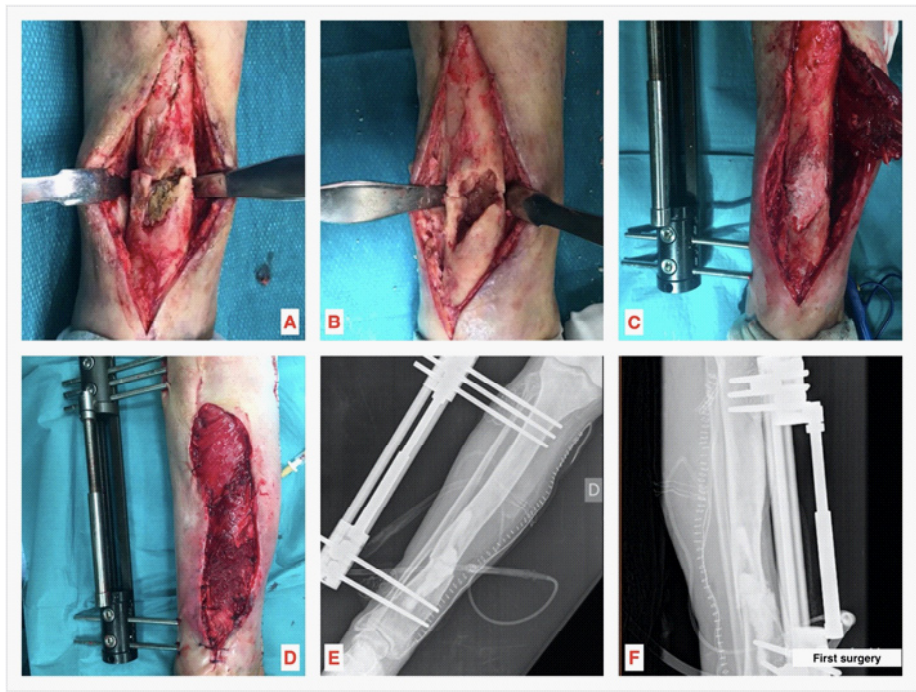
Figure 2: First surgery: soft tissue and bone debridement (A,B); use of synthetic antibiotic loaded bone substitute to manage dead space, provide local antibiotics and bone support (C); defect coverage with an inverted hemisoleus muscle flap and a rotated medial gastrocnemius muscle flap (D); anteroposterior and lateral post-operative conventional radiographs (E,F).