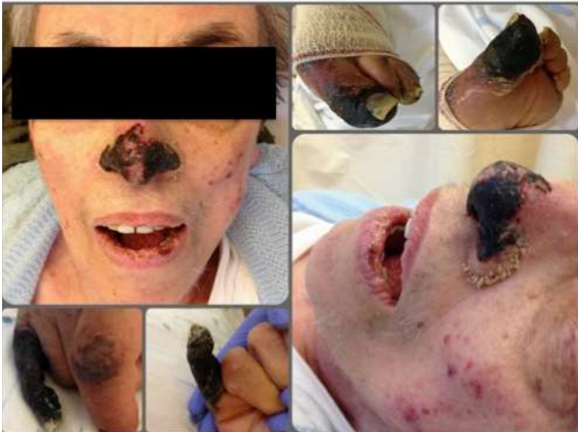
Figure 1: Complete mummification of the fifth finger of both hands, both first toes and gangrenated tip of the nose.

On arrival, she was stuporous, shivering, moaning and not responsive to interrogation. She was severely dehydrated, pale, cachectic, but otherwise haemodynamically stable, and had no tachypnoea, fever or lymphadenopathy. Cardiopulmonary auscultation: arrhythmia (HR around 80); basal bilateral fine crackles. Nonexudative gangrene (mummification) was observed on all four distal limbs and the nasal pyramid ( Fig. 1 ).