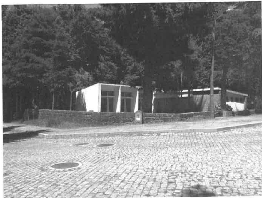
Fig. 4 – Primary school of Vascões settlement of the agricultural colony of Boalhosa, Paredes de Coura, Portugal

any orientation on the land – such as in Italy (Puglia and Lucania) – and in the models of expandable houses of the Spanish National Institute of Colonization (43), the architects of JCI conceived different designs of prototype houses which, in their simplicity, were a substantial improvement on the habitability of the rural house.