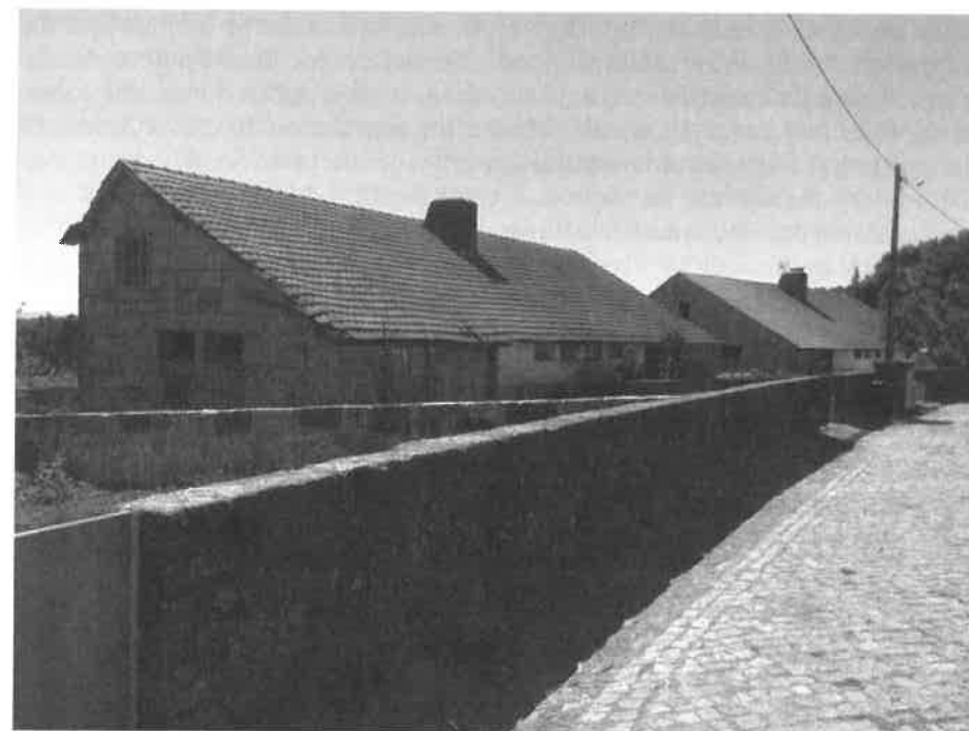
Fig. 2 – Settlers houses. Vascões settlement of the agricultural colony of Boalhosa, Paredes de Coura, North of Portugal

implemented on lands belonging to the State (23), in Pegões, in the south of the country, in a fertile area close to the Lezíria in the region of Ribatejo.