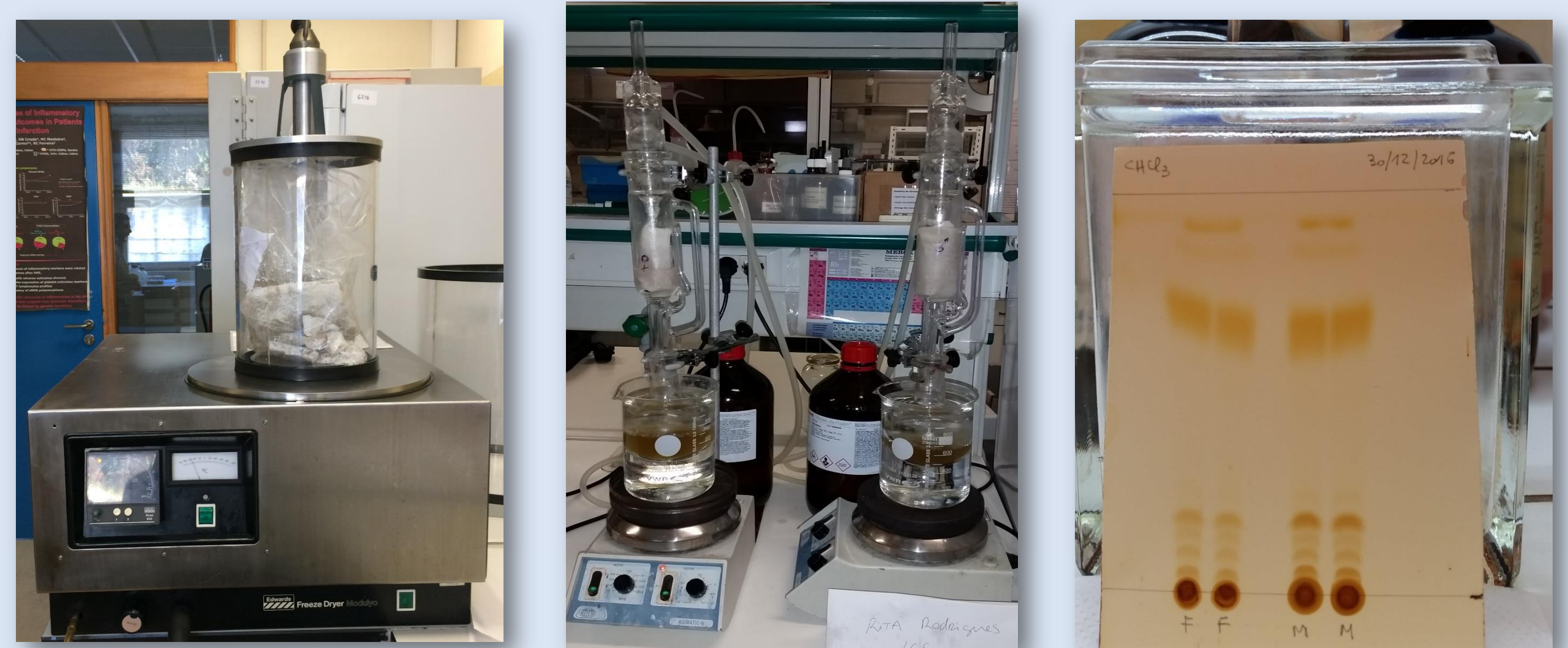
Fig. 2. Sample preparation for GC-MS and previous analysis.

Chloroform soluble compounds were obtained by soxhlet extraction from the lyophilized gonads of C. tagi (Fig. 2).