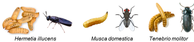
Fig. 2. The most relevant insect species for fish meals: H. illucens , M. domestica and T. molitor .

meal supplementation in various fish species have shown positive impacts on growth performance and feed consumption, among other advantages showed in Table 4. Research demonstrates the potential to enhance the cardioprotective characteristics of fish fillets through tailored insect fatty acid profiles, further emphasising the versatility and adaptability of HIL in aquafeeds (Bruni et al., 2020)