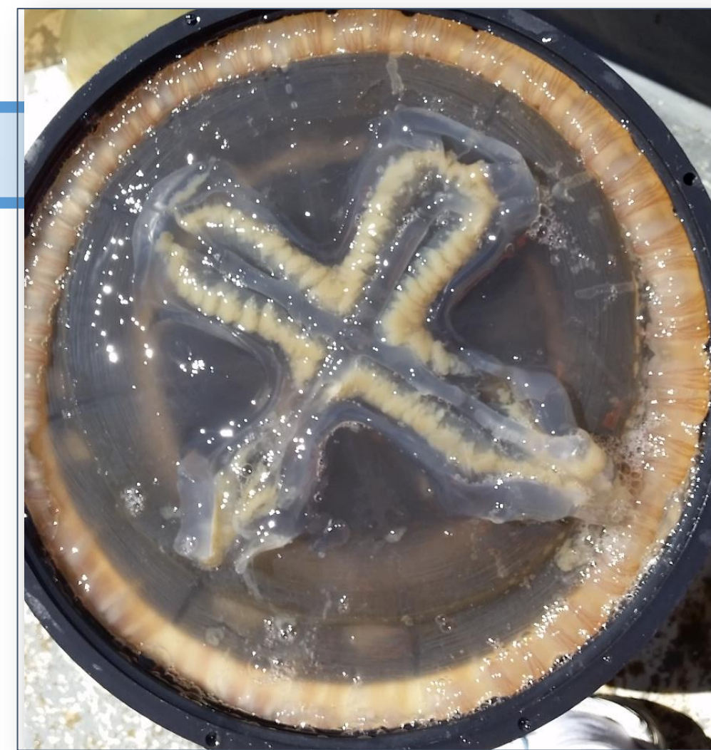
Fig. 2- C. tagi gonads (photo by R. Lisboa).

The macroscopic aspects of the gonads were compared with microscopic observation of fresh preparations and histological slides, stained by hematoxylin-eosin (H&E).