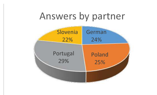
Graph 1 – Number of answers by partner

The final version of the survey was carried and 88 answers were collected. The distribution of the collected data is presented below: