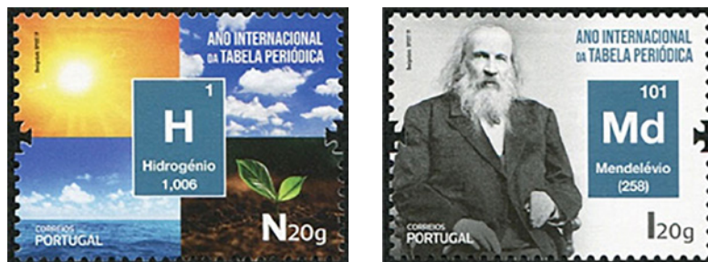
Figure 2 The two stamps issued by the Correios of Portugal celebrating the International Year of the Periodic Table .

Another perspective from the mathematician and musician Tom Lehrer, who also lectured mathematics and music theater at the University of California, Santa Cruz, is the song " The Elements ", in which he set names of the chemical elements to the tune of a music by Gilbert and Sullivan and can be seen in a live performance registered in Copenhagen in 1967 [L].