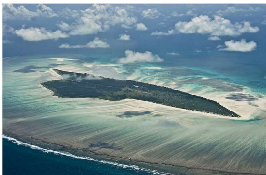
Figure 2 – Aerial view of Juan de Nova Island.