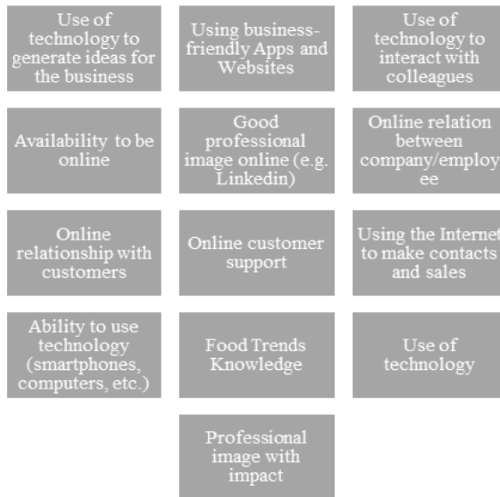
Figure 1: Factor 1 Emotional and Relational Skills.