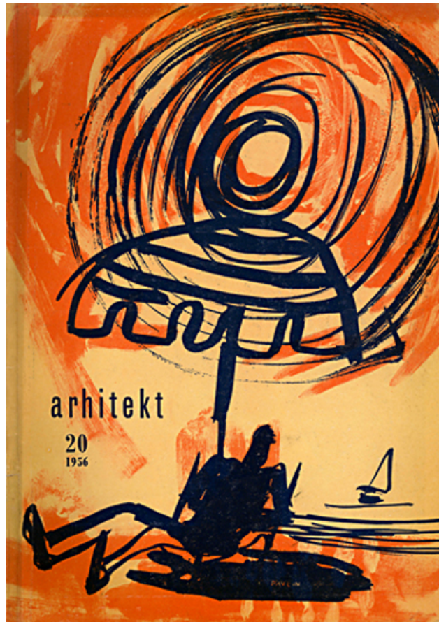
Figure 4. Cover page of architectural journal Arhitekt (Ljubljana), No. 20, 1956

regretfully observed that Yugoslav architects were completely “physically and spiritually absent” from the Dubrovnik CIAM ( Arhitekt , 1956).