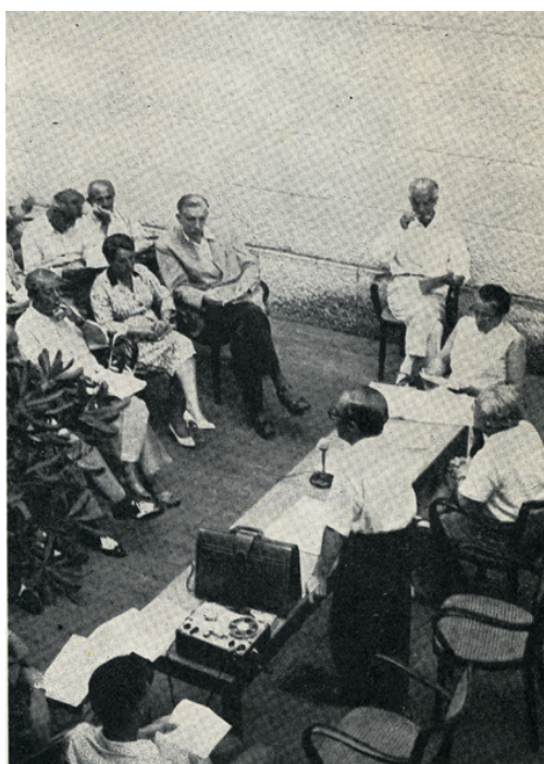
Figure 1. CIAM 10, Dubrovnik 1956.