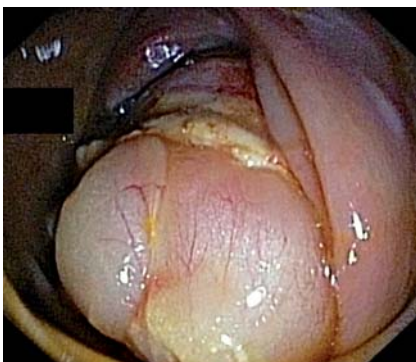
Fig. 3 Fat seen extruding from the mass after the unroofing procedure.

A 52-year-old man with a 1-year history of lower abdominal pain and constipation was referred to our unit for endoscopic resection of a large lipoma in the ascending colon, which had been detected by abdominal computed tomography (CT). Colonoscopy revealed a 50-mm, subepithelial, broad-based, polypoid mass in the as-