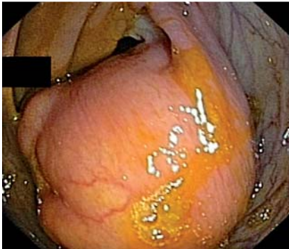
Fig. 1 Endoscopic view of the large, subepithelial, broad-based, polypoid mass with smooth, yellow surface in the ascending colon.